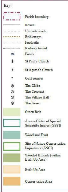
Map of Woldingham Parish