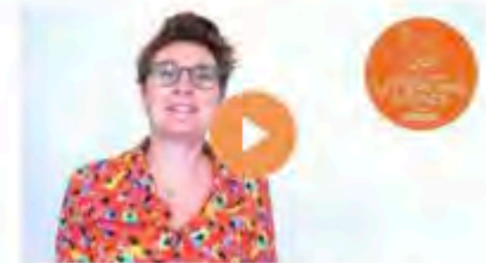
How to say Phase 5 sounds