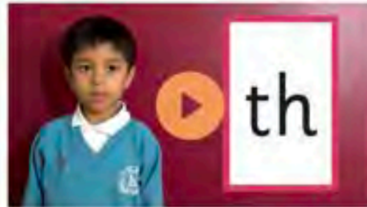
Phase 2 sounds taught in Reception Autumn 2