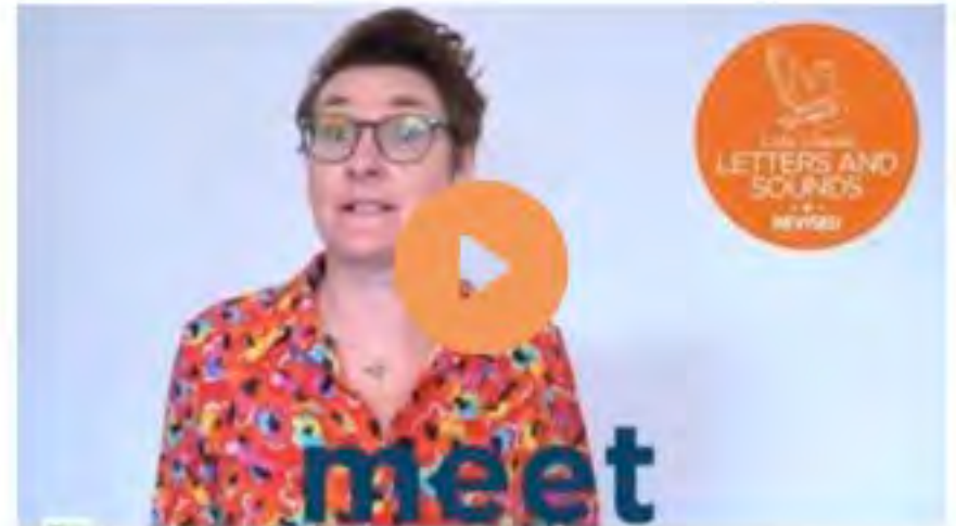
How we teach Phase 5

The 'Grow the code' lessons support children with reading and spelling these alternative spellings.