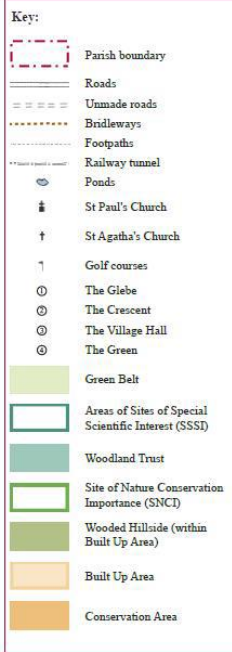
Map of Woldingham Parish